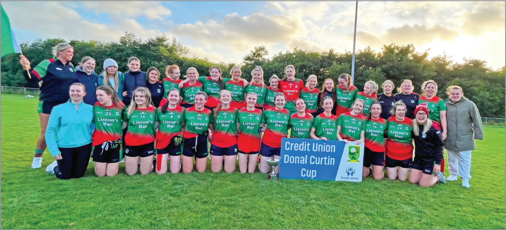
Congratulations to the Beale LGFA Senior team who won the Credit Union Donal Curtin Division 5 Cup on Monday after victory over MKL Gaels B

Congratulations to them on a successful weekend and their innovative new Scotch Foursomes format. This weekend sees a number of entries from the county in the National O55's Strokeplay Championships as we wish those involved the very best of luck.