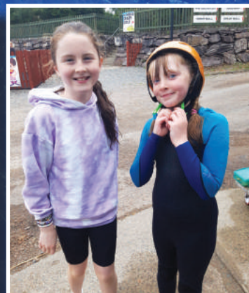
Members of Club Óg-Ógras Lios Tuathail/Baile an Bhuineánaigh had a great day out at Star Outdoors in Kenmare recently