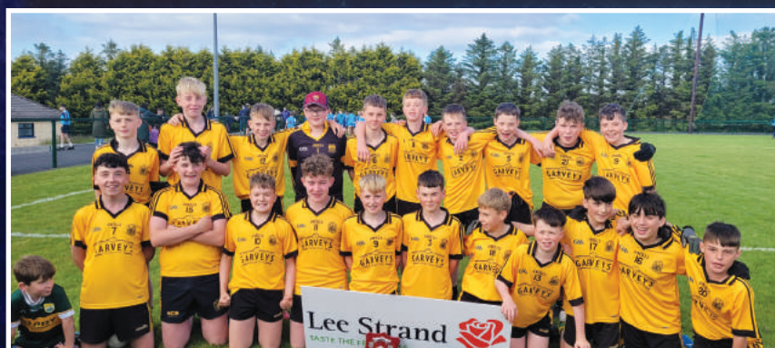
Listowel Emmets U13 boys are County League winners as they start the North Kerry League campaign