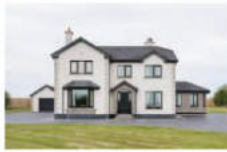
2 Storey Detached Grant €3,500*