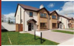
2 Storey Semi Detached / End Terrace Grant €2,800*

Huge Grants and Subsidies Available Work can typically be completed for the cost of a BER Certificate