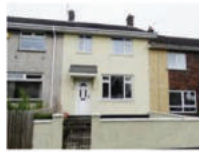
Terraced House Grant €2,300*