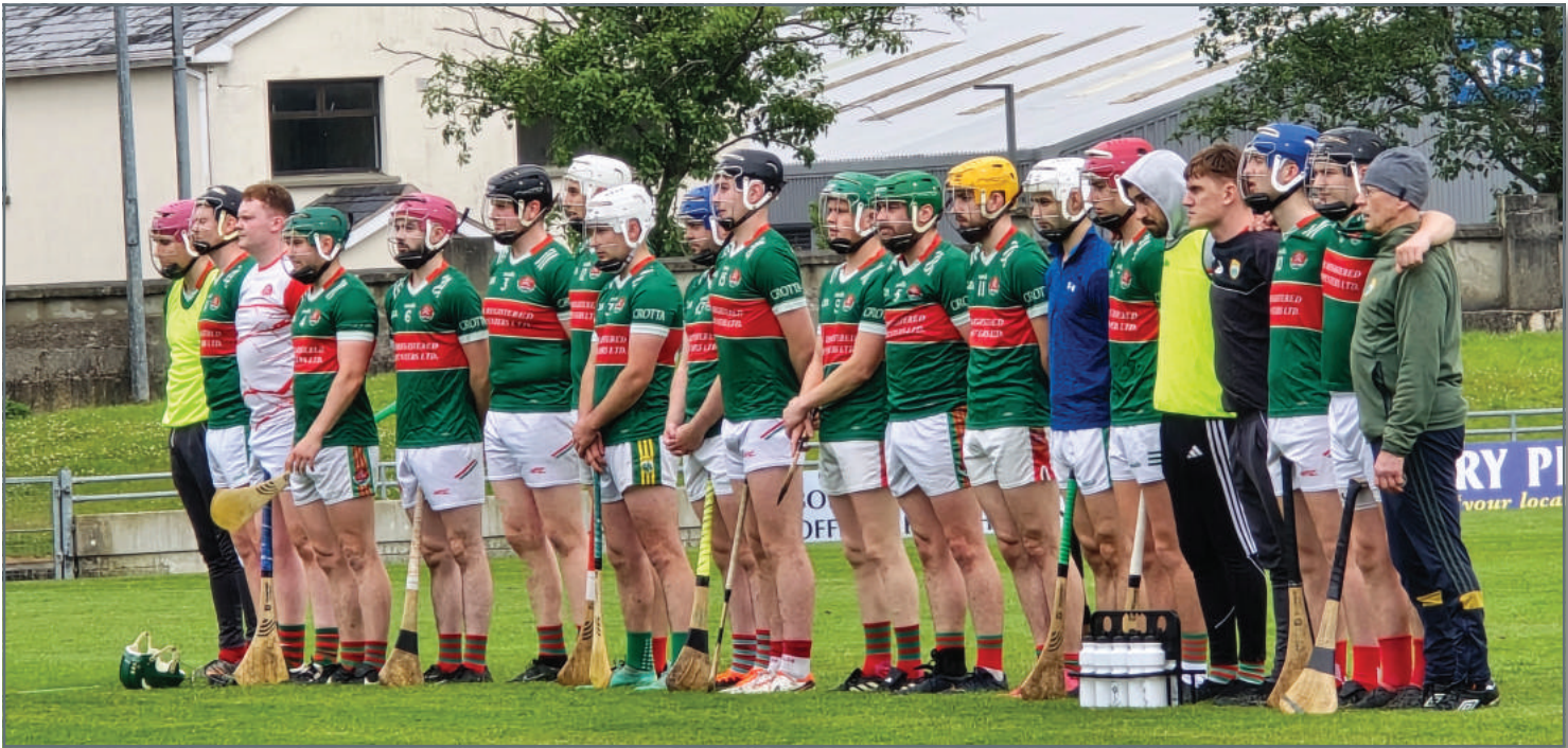
Crotta Senior hurlers observed a minutes silence in memory of Mícheál Ó Muircheartaigh on Friday evening before their Garvey's SuperValu County Senior Hurling Championship game against Ballyduff in Austin Stacks Park, Tralee.

Parish Office can be contacted by phone 066 4018996 Tuesday, Thursday & Friday 10.00 a.m. to 1.00 p.m. or by email: abbeydorney@dioceseofkerry.ie Webcam has been installed in Kilflynn Church – To watch Masses go to www.dioceseofkerry.ie – Abbeydorney Parish and click on 'watch Mass'. Diocesan.