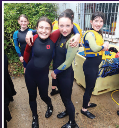
Members of Club Óg-Ógras Lios Tuathail/Baile an Bhuineánaigh had a great day out at Star Outdoors in Kenmare recently