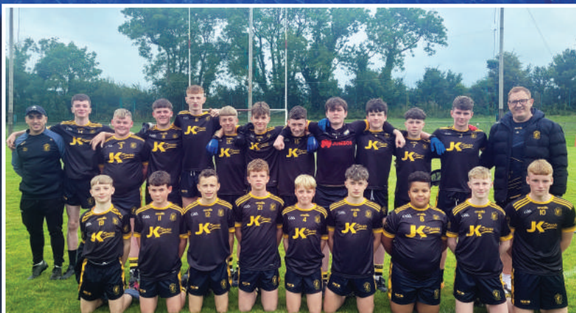
The Listowel Emmets U15 boys who reached the Féile Competition Final in Mallow last Saturday